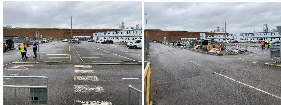
Yard 3 – Rectangular site with fully tarmacked surface, fenced and gated with power, water and drainage.