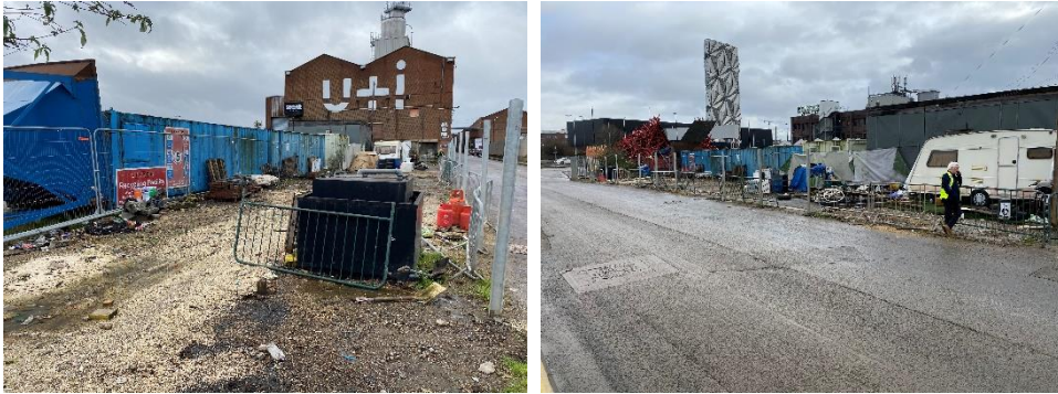
Yard 1 – Rectangular site with loose hardcore surface, unfenced with no services.