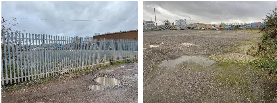
Yard 2 – Rectangular site with compacted hardcore surface, fenced and gated with no services.